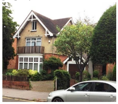
6 Ashburton Road

Do keep an eye on our website - <a href="http://www.home.addiscombe.net/">http://www.home.addiscombe.net/</a> - where, among other things, you will find news on planning applications and an update on anything we have done or are planning to do. One recent planning application has stirred us into action. This relates to the property at 6 Ashburton Road, a fine family house given a favourable comment in our